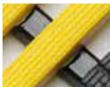
Black/Yellow Safety Strips